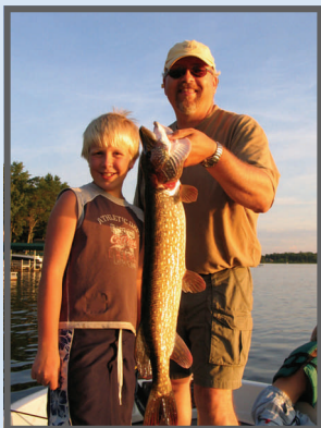
Fathers in the Field is about faith, fatherhood, forgiveness, and fun!